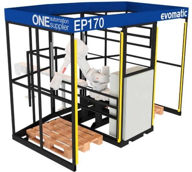
VIEW FROM THE SIDE