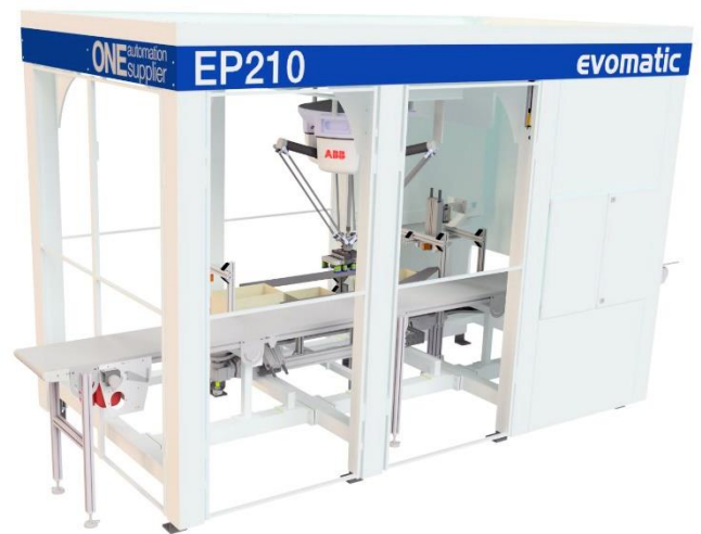
VIEW FROM THE SIDE