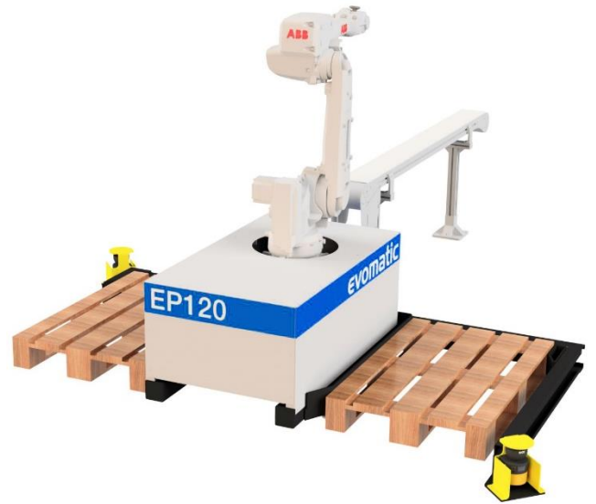
VIEW FROM THE SIDE